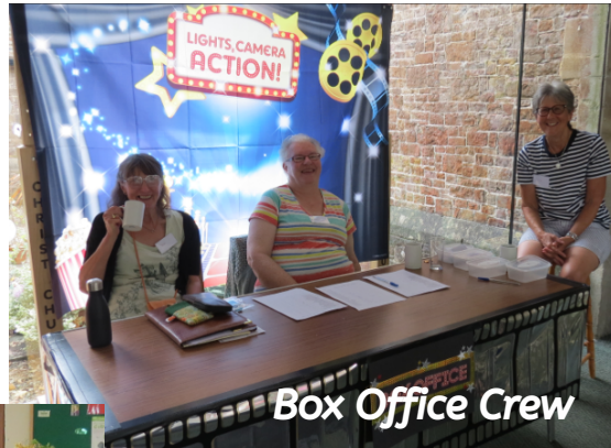
Box Office Crew