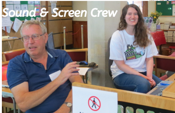
Sound & Screen Crew