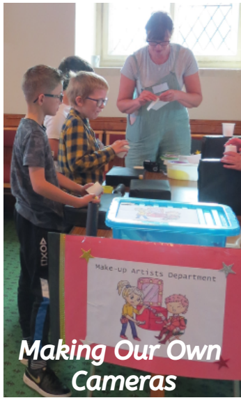
Making Our Own Cameras

A big 'Thank You' to everyone who helped with Holiday Club this year. As well as those pictured, many people helped behind the scenes. We could not have done it without you!