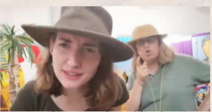
Hmm - this story needs careful explanation

It's been more than 20 years since Joseph's brothers sold him as a slave and now they stand before him, asking for food. They have no idea that their little brother is this mighty Egyptian ruler.