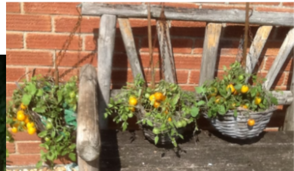
Carl's Collection looks amazing