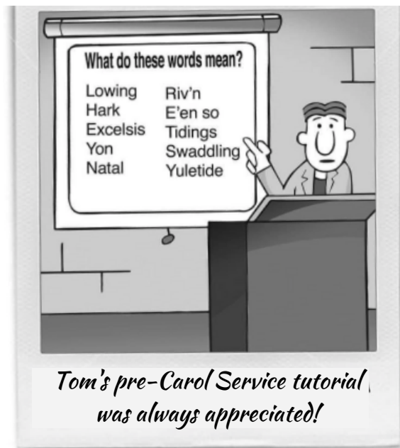
Tom's pre-Carol Service tutorial, was always appreciated!