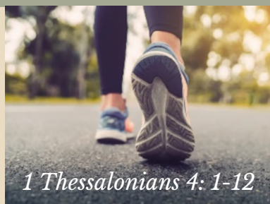
1 Thessalonians 4: 1-12