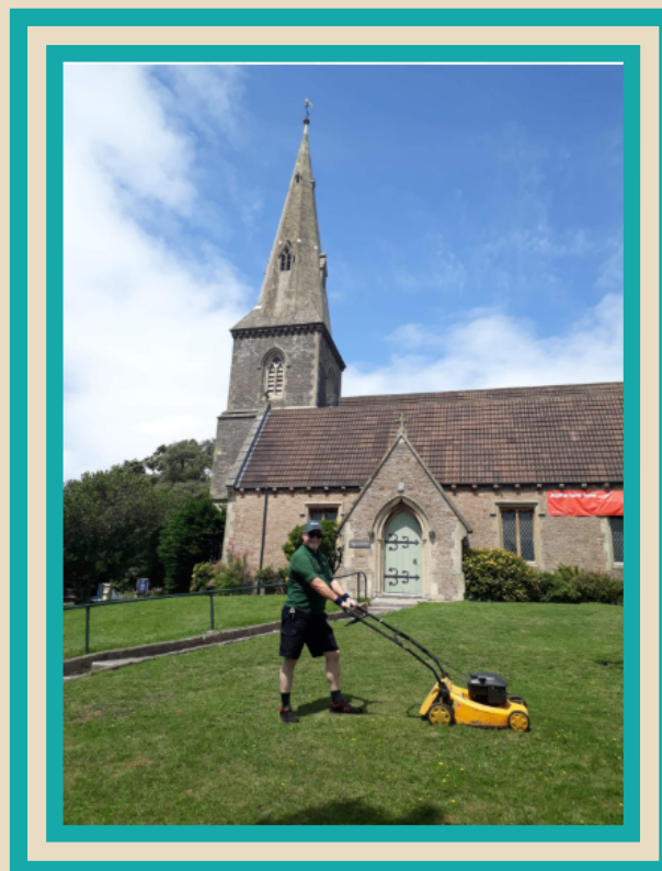
One of our willing volunteers cutting the church grass this week! Thank you to all the people on the grass cutting rota who keep the grass cut throughout the year.